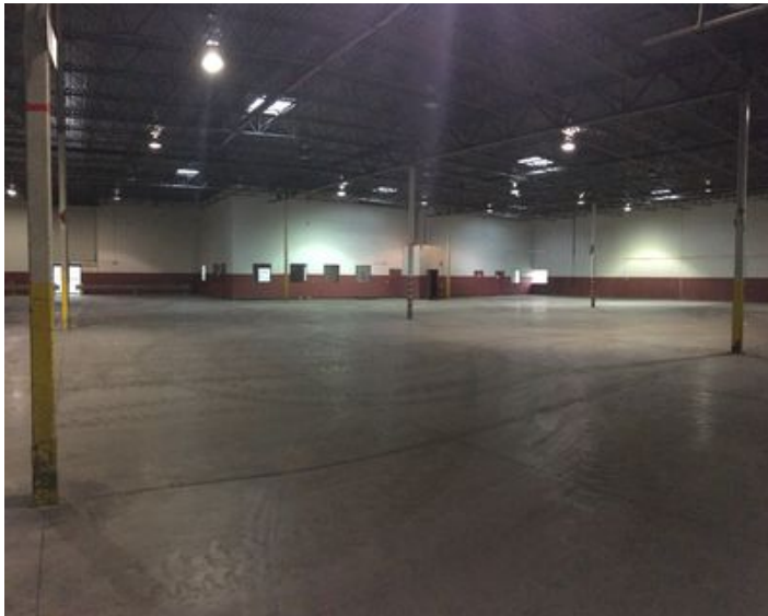
Airport Business Center 16,800 sq.ft