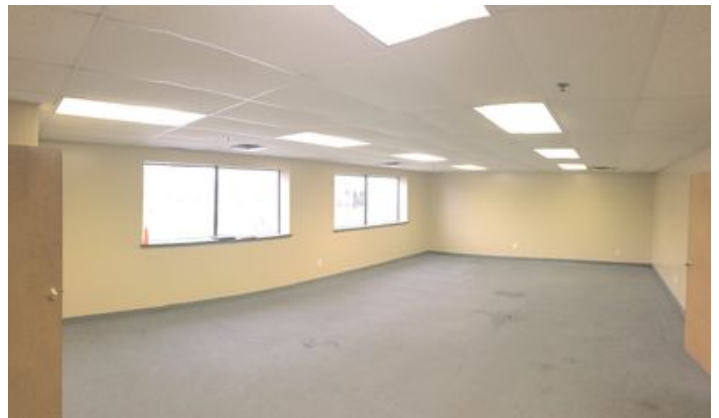
Airport Business Center 16,800 sq.ft