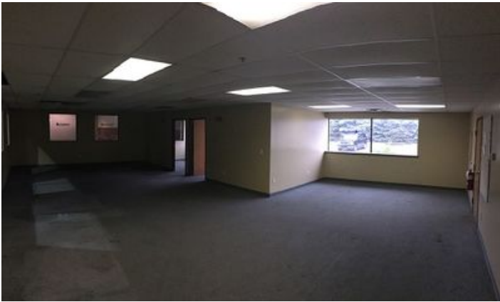
Ariport Business Center 16,800 sq.ft