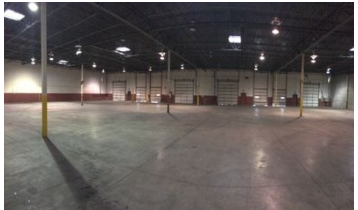
Airport Business Center 16,800 sq.ft