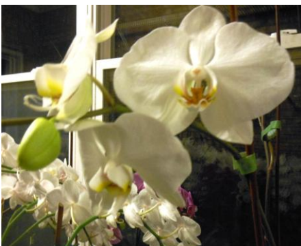
Poor flower shingling

To learn more about potting Phals, attend our Orchids 101 class. Glen will show you how to repot and answer any of your concerns.