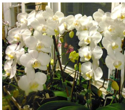
Good example of shingling