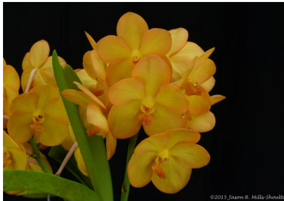
Vanda Yarnisa Gold Morning Sun' AM/AOS