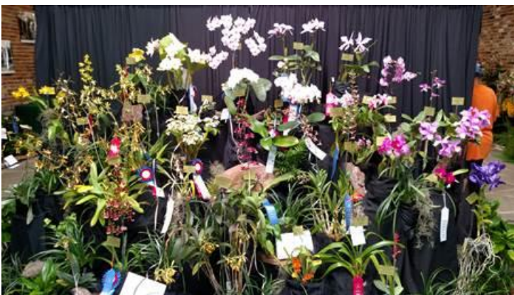
2016 GCOS exhibit in Mobile Area Orchid Society Show

If you have some free time Saturday please drive over to Houma and support the show. The show is in the Sears corridor in Southland Mall in Houma.