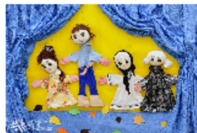
Homeless girl finds hope at puppet show in Myanmar

To register, complete this form, enclose check and mail to: