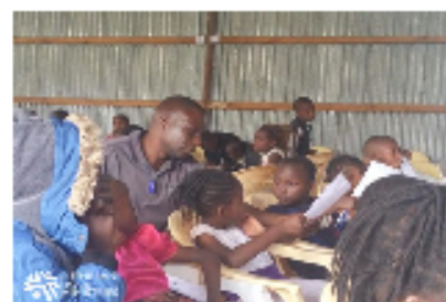
LHM-Kenya VBS Reaches 100 Children