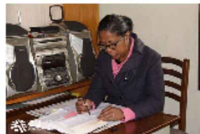
Booklets help strengthen sick woman's faith in Madagascar

Directions: Take I-380 until exit 10 (Swisher, Shueyville) and head east on 120 th St. [F12] until stop sign. Turn right onto NE Curtis Bridge Rd. and follow it until Sandy Beach Rd. Turn left onto Sandy Beach Rd. and follow it to the Camp. Watch for Camp signs.