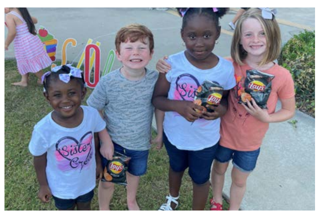
First Day of School