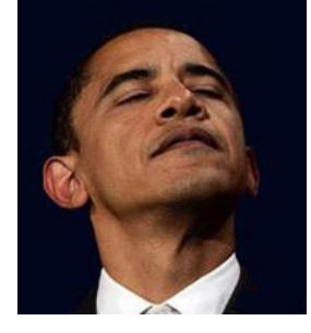
Page 1 of 5