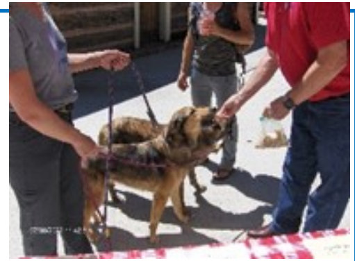
Above: Proof! Dogs like lefse!

We are meeting people with memories of Grandmas, aunts, moms, and other family members making lefse for special occasions, some who were filled with emotions and were brought to tears. We also found out that lefse is dog friendly!!!