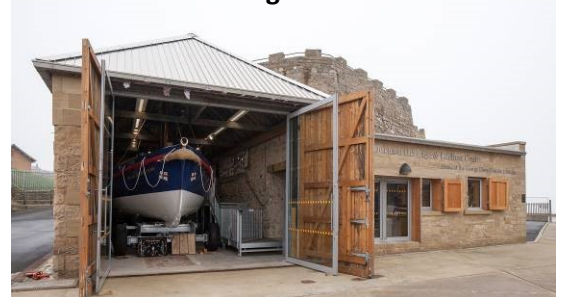
East Durham Heritage and Lifeboat Centre

Or perhaps you want to kick off your shoes and feel the sand between your toes on the beautiful Slope Beach.