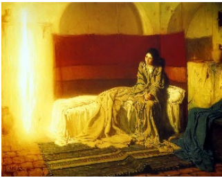
The Annunciation by Henry Tanner 1898

Getting back to the Blessed Mother, I never really had great devotion to her but on my annual retreat this year that changed. My spiritual director suggested I go to Mary with my grief. My reaction was, “I’m surrounded by women, that’s the last person I want to go to,” but I went. I decided to give Mary a chance! After all, it’s all about me!