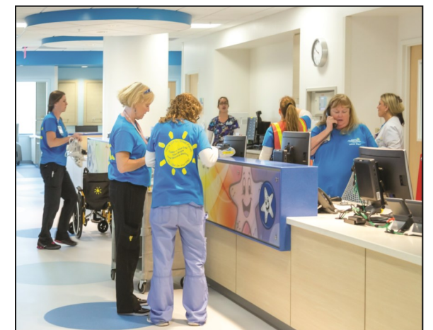
The new Emergency Department is on pace to see 40,000 kids in its first year of operation – over five times what they saw in 2001!