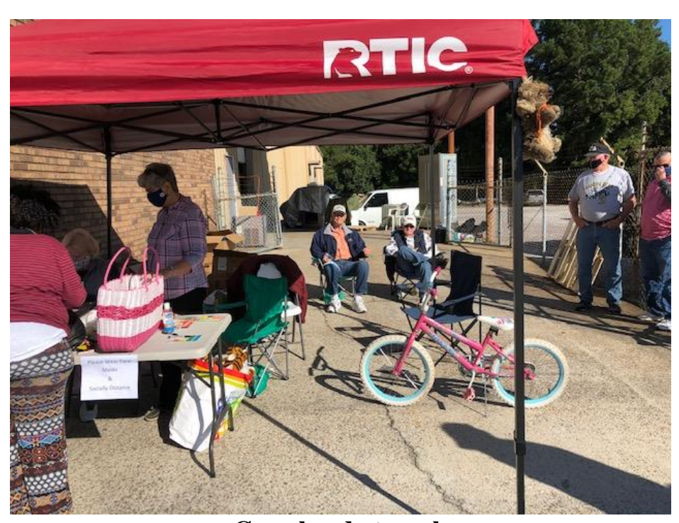
Guys hard at work