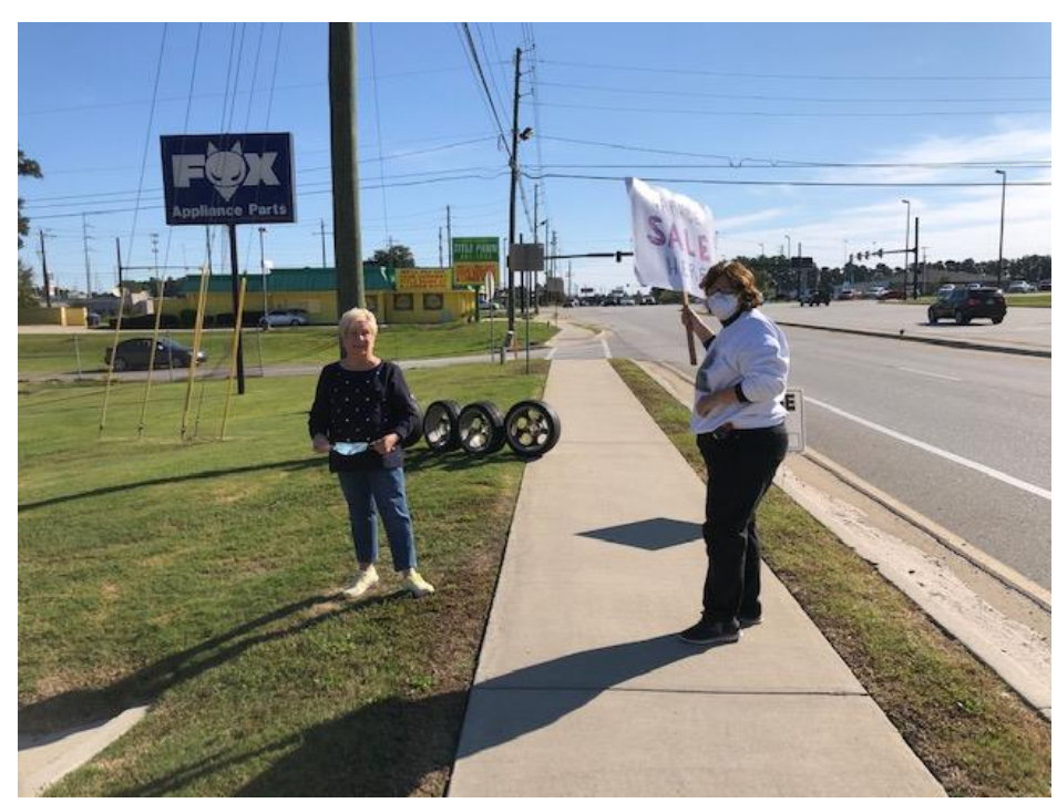
Got to wave the signs