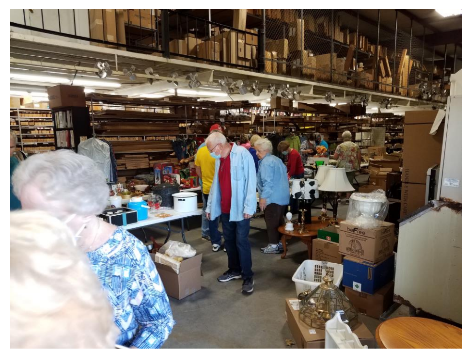
Friday night sorting