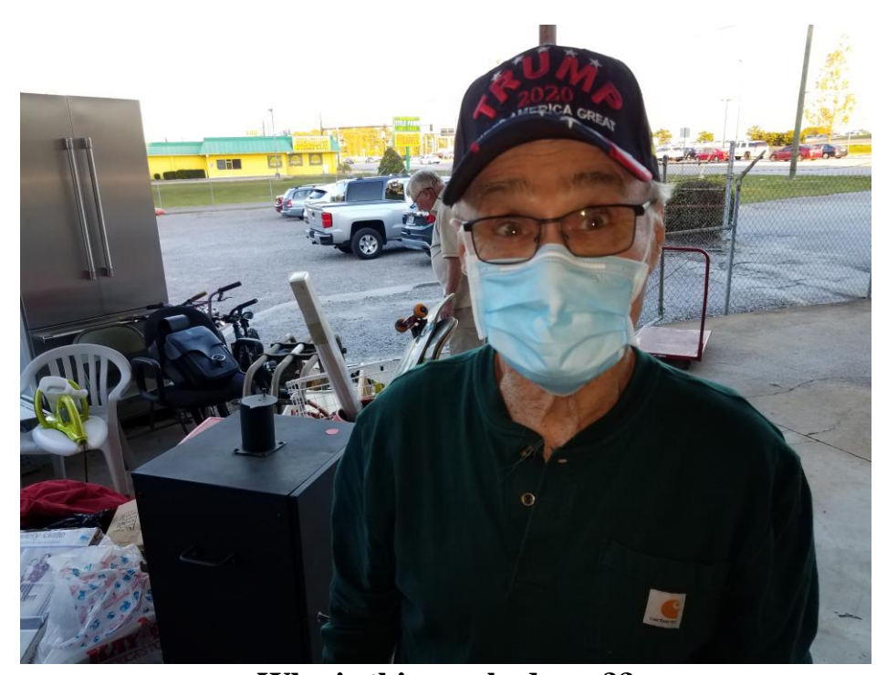
Who is this masked guy??

There are still 15 members who get this newsletter through the US Mail rather than through e-mail. Since these members do not use e-mail, they do miss out on other notices and updates which typically are only sent through e-mail or listed on the club's webpage (gascarclub.com). So if you are a US Mail recipient, please also check the webpage (if possible) for updates.