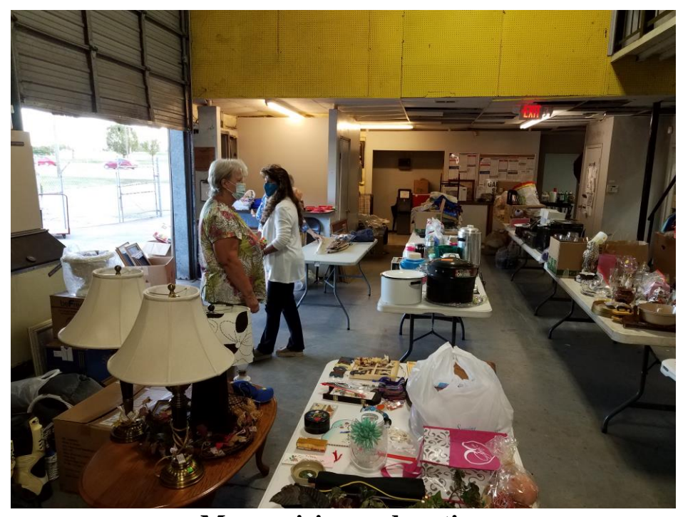
More pricing and sorting