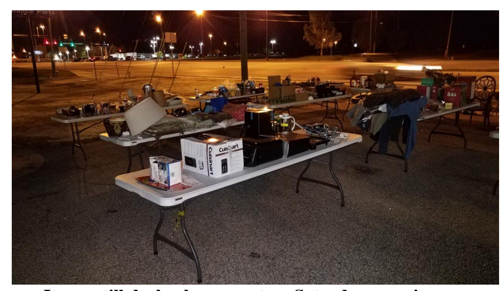
It was still dark when we set up Saturday morning