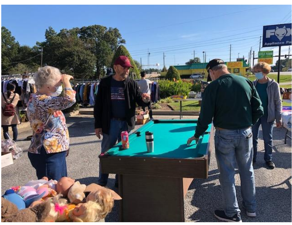
Big boys looking at toys (and being closely supervised)