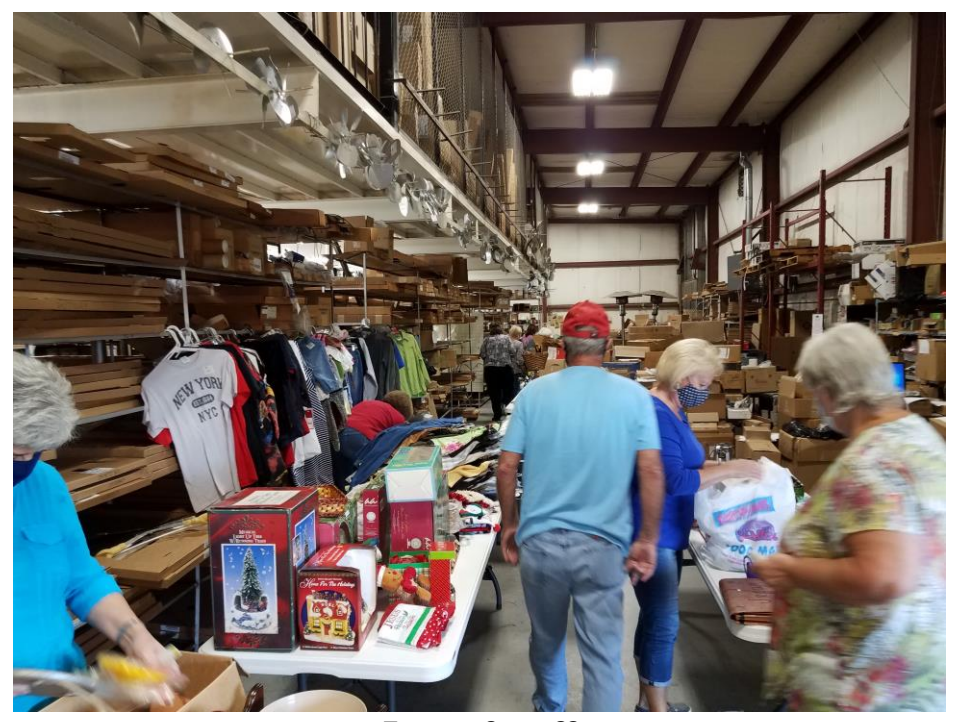
Lots of stuff