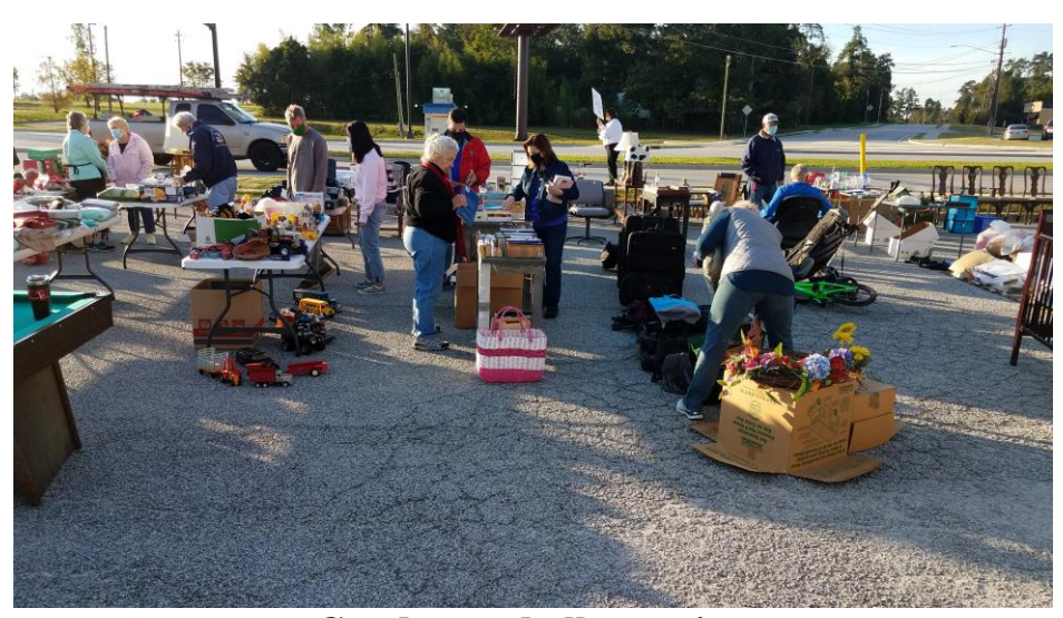
Good crowd all morning