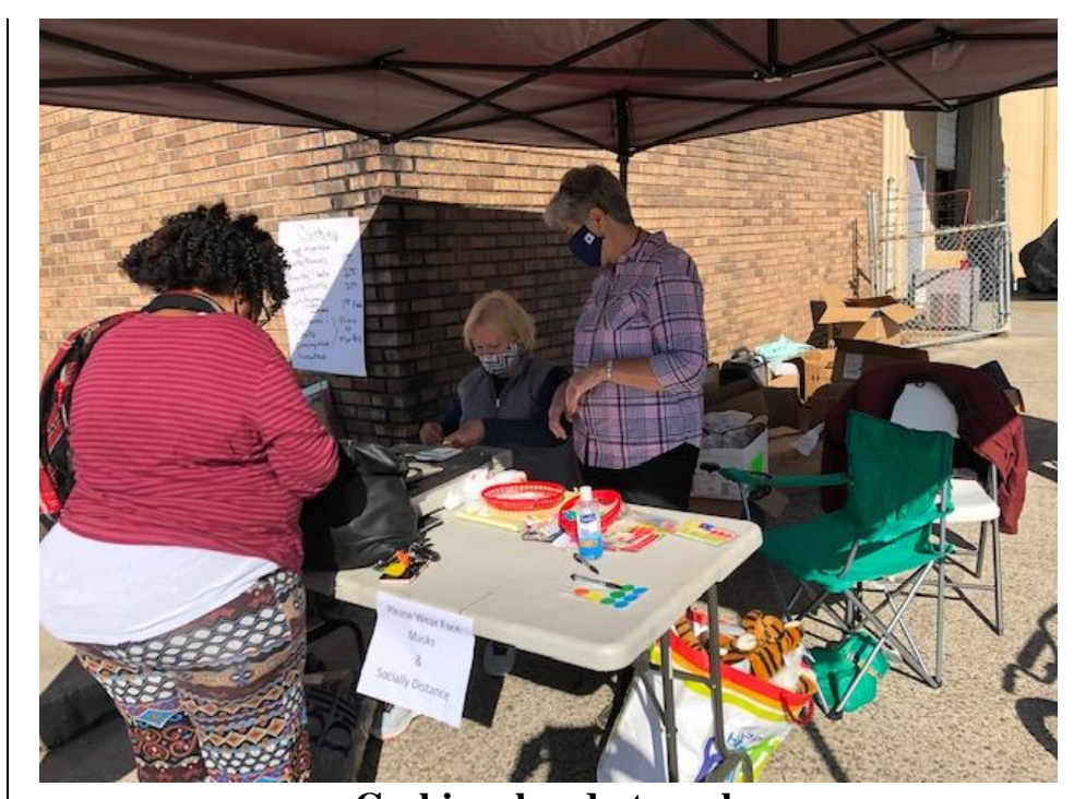
Cashiers hard at work