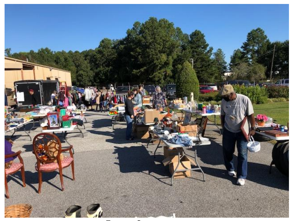
Lots of treasures