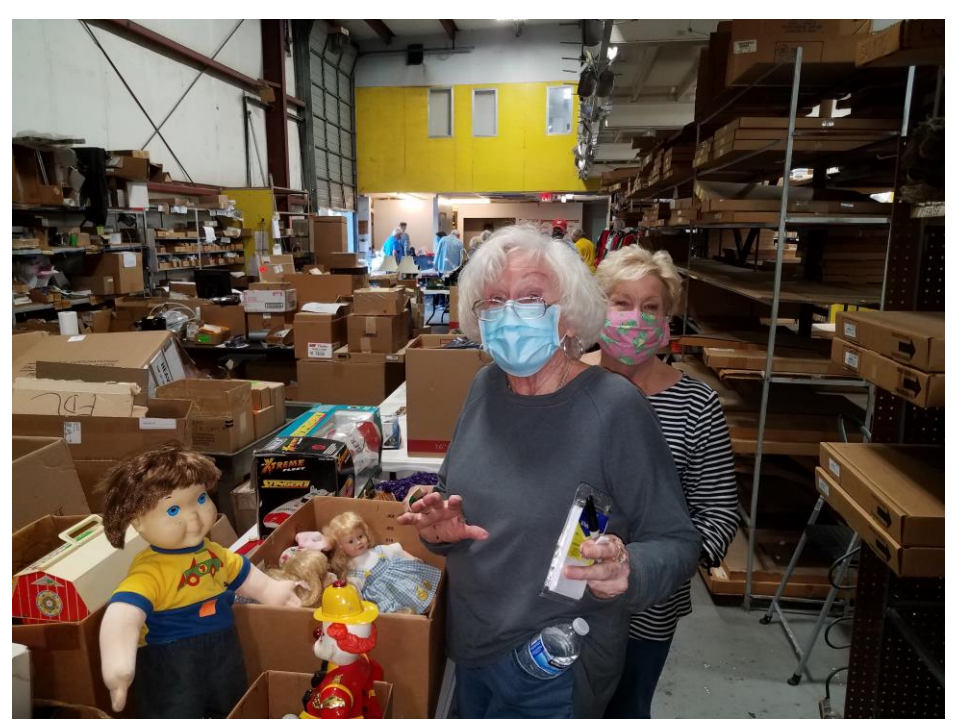
They might be playing with the dolls