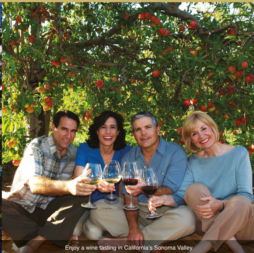
Enjoy a wine tasting in California's Sonoma Valley