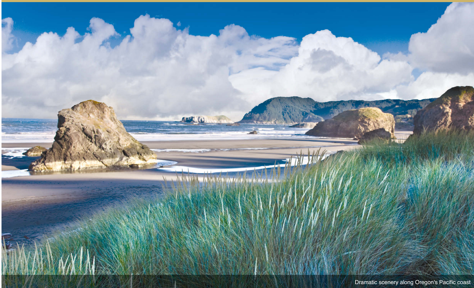
Dramatic scenery along Oregon's Pacific coast