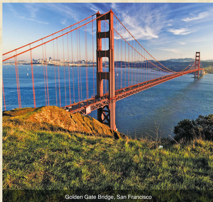
Golden Gate Bridge, San Francisco

Depart for home from this memorable vacation with a group transfer to San Francisco International Airport for flights out after 12:00 p.m. Meal: B