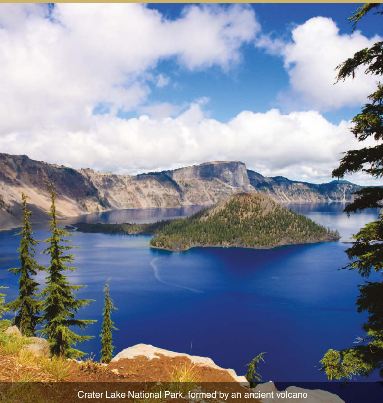
Crater Lake National Park, formed by an ancient volcano