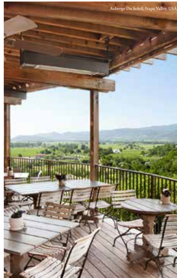
Auberge Du Soleil, Napa Valley, USA