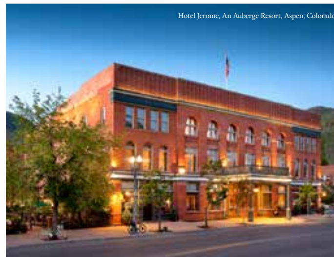
Hotel Jerome, An Auberge Resort, Aspen, Colorado