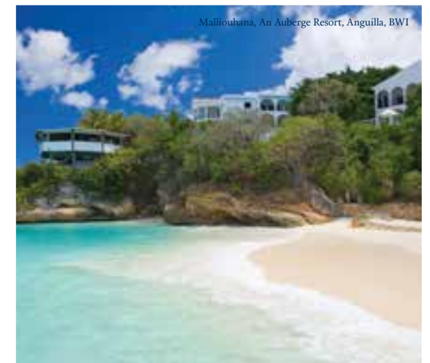
Malliouhana, An Auberge Resort, Anguilla, BWI