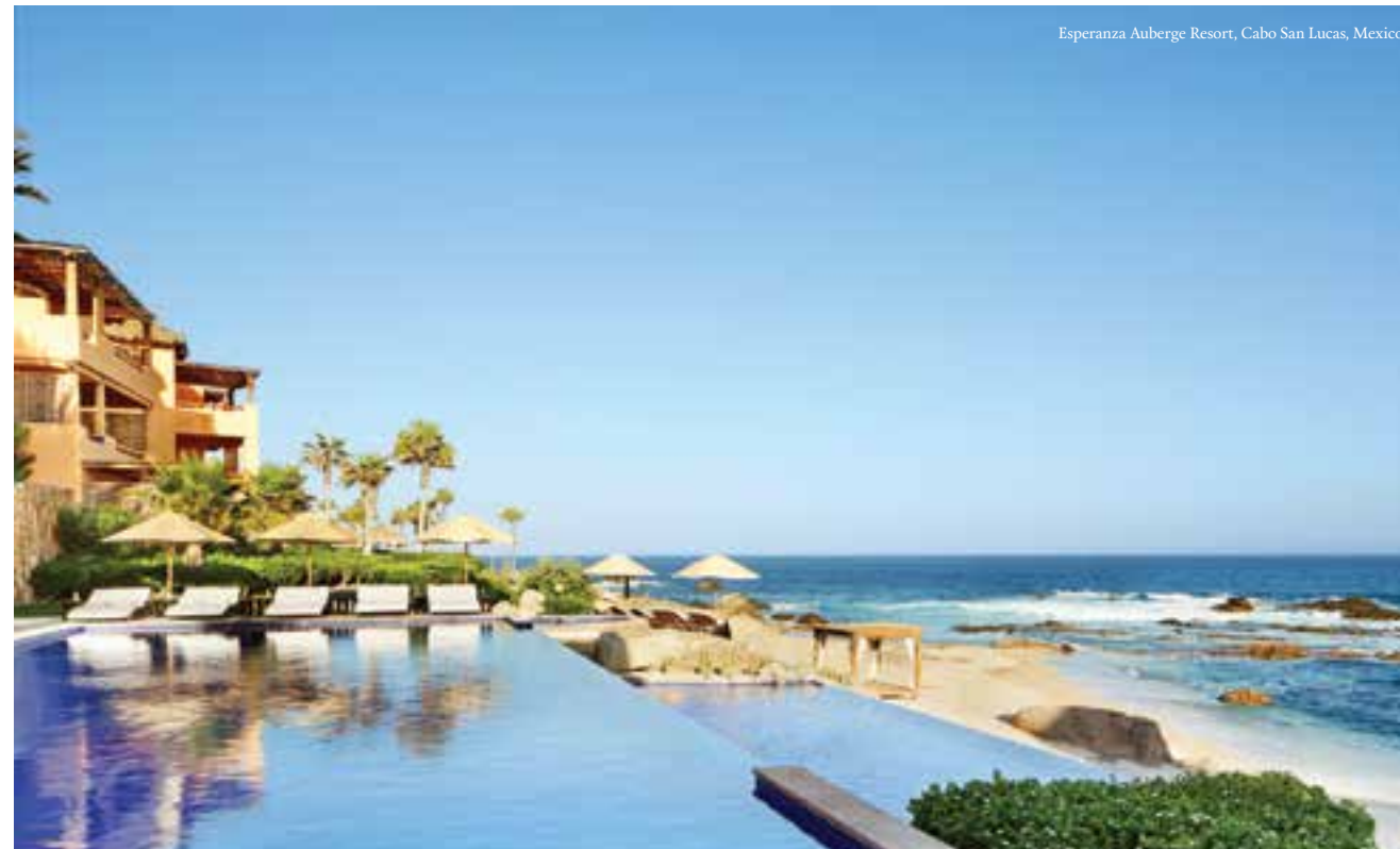
Esperanza Auberge Resort, Cabo San Lucas, Mexico

From blissful beachfront escapes to tranquil mountaintop retreats, each Auberge property is unique and authentic to its location. Carefully curated activities highlight the most desirable aspects of the surrounding region and culinary destinations bring the talents of highly skilled chefs together with the freshest ingredients to offer innovative dining in inspired surroundings. Auberge's renowned spas call on the deep healing power of the environment to provide a variety of paths to relaxation and well-being, and throughout every property residents and guests enjoy service that is delivered with genuine care in an environment dedicated to the enjoyment of every moment.