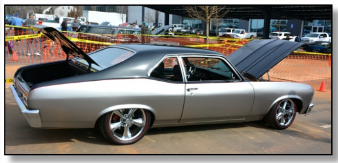
Want to see even more photos? Check out our Facebook page for