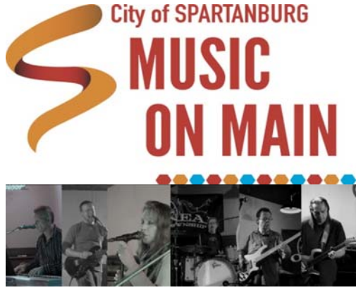
May 28 O'Neal Township