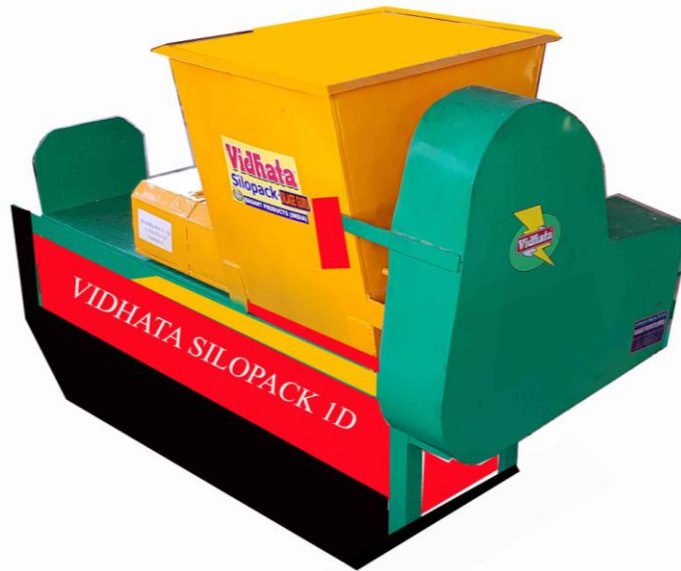
1D drum 25 kg type SILAGE BAG PACK

DESIGNED FOR SMALL SCALE DAIRY FARMERS FOR THERE OWN USE AND BUSINESS INSPIRED BY MODI AGRI SCHEMES OF DOUBLE FARMERS INCOME BY 2022