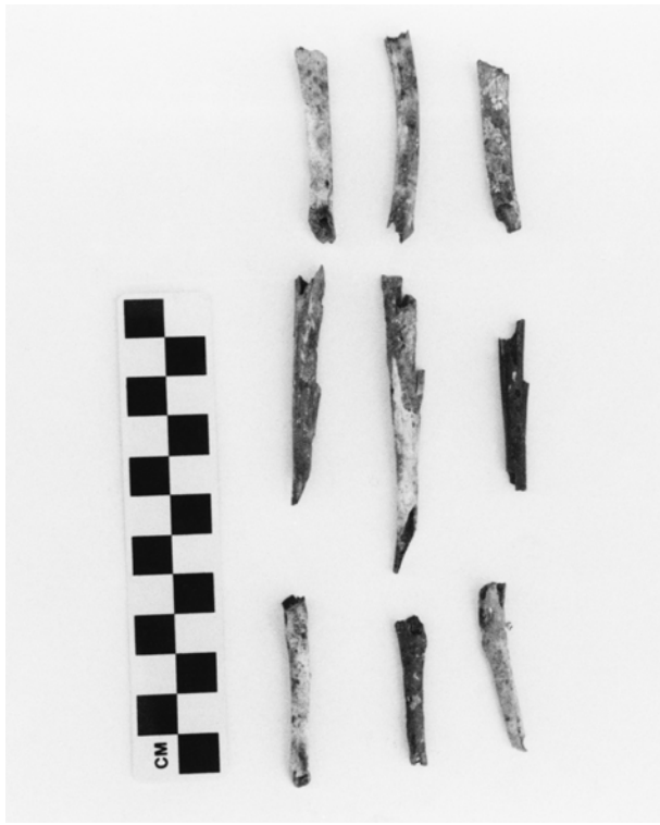
Figure 3. Rabbit long bone cylinders from the two hearth features in strata F and G/I, Picareiro Cave. Top row: femora cylinders; middle row: tibiae cylinders; bottom row: humeri cylinders.

raptors, and rodents occasionally create rabbit long bone cylinders by chewing or breaking off the ends of limb bones, they rarely do so (see, for example, Hockett, 1995). Rabbit long bone cylinders created by rodent gnawing display the taphonomic traces of closely spaced, parallel scour marks created by rodent incisors. Those created by carnivores and raptors may mimic cylinders created by humans, but these bones are vastly outnumbered by complete to nearly complete rabbit limb bones deposited in the same site by these predators (Ripoll, 1993; Hockett, 1995).