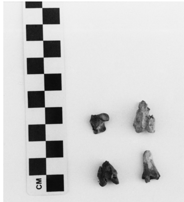
Figure 4. Typical rabbit long-bone ends recovered in the two hearth features, strata F and G/I, Picareiro Cave: proximal femur (top left), distal femora (top right and bottom left), and distal tibia (bottom right).

In contrast, because humans may deliberately break off the ends of rabbit long bones in order to consume marrow, prehistoric hunters may discard very large numbers of rabbit bone cylinders in archaeological sites. For example, 400 rabbit long bone cylinders were recovered from within the two hearth/burning pits at Picareiro Cave, while only 12 complete femora, tibiae, and humeri were recovered from these same features (see Table 4). A total of 584 proximal and distal ends of femora, tibiae, and humeri were also recovered from the hearths (Table 4 and Figure 4), indicating that natural destruction of the cancellous portions of the long bones was of minimal consequence in the creation of these cylinders. It is also noteworthy that 52 of the 64 (81%) complete limb bones from strata F and G/I were non-marrow filled radii and ulnae. Further, Yellen (1991) documented ethnographically that the