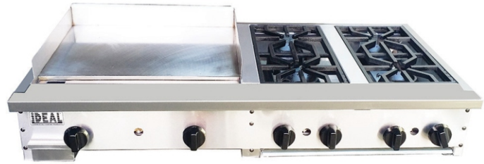
Snack Line Combination Units