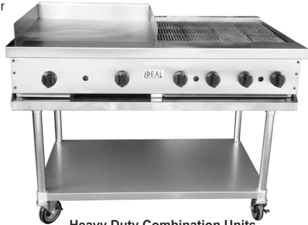
Heavy Duty Combination Units

Ideal Commercial Cooking Products, Inc. Combination Units vast variety of products offer any possible design arrangement to satisfy the most exigent chef needs and requirements or simply to fit and maximize the back yard spaces for those who love entertain and cook. The double sided panels and heavy duty chassis along with cast iron top grates and burners complement these units' rough appearance. Models ranging from 12" to 72" are available, either for heavy duty or Snack line. Ideal Commercial Cooking Products Counter top Line-up align perfectly with other Ideal Products on height, depth and other design alike features such as bull