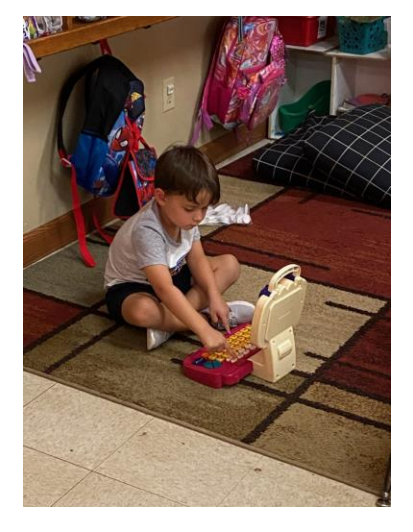
Figure 7: Apple Computing,Pre-K edition.