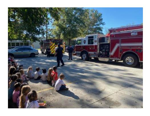
Figure 1: Thank you to Gibsonville Fire Department, in remembrance of 9/11, for coming out to talk to the children.