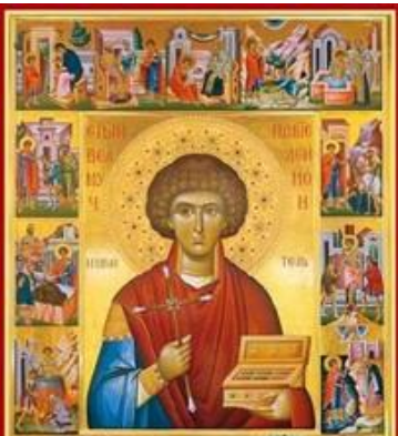
Gr. Martyr and Healer St. Panteleimon