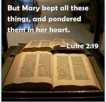
Our Mission: To Proclaim the Kingdom of God for the Salvation of Souls

Church (717) 532-2912 Campus (717) 477-1244 Emergency (717)323-2679