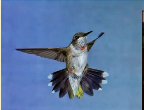
Flaring - 27 Paul Munch