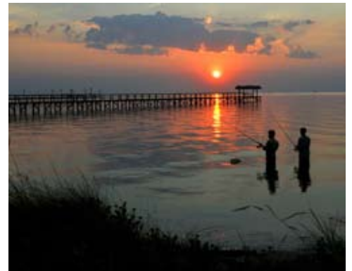
2nd Place Beverly Lyle "Waiting for a Catch"