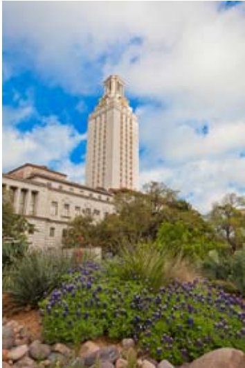
1st Place Leslie Ege "UT Tower with Bluebonnets"

In the Assignment category--the Winners are: