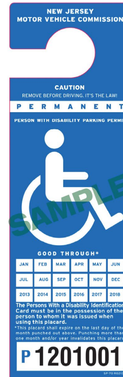
FIGURE 2: Permanent Person with a Disability Placard