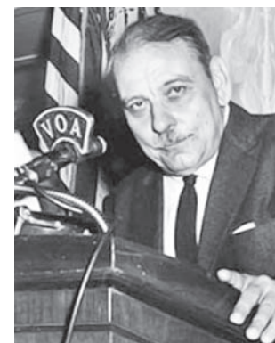
Luis Muñoz Marín