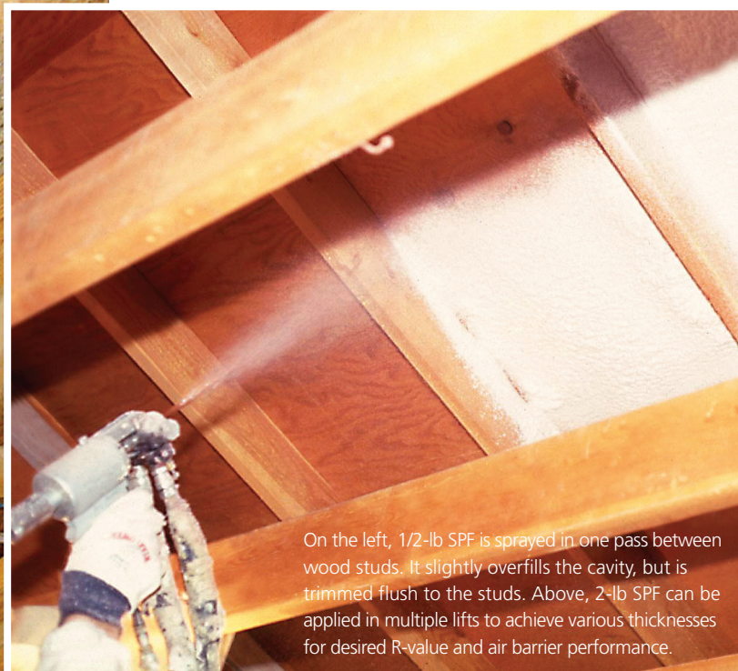
On the left, 1/2-lb SPF is sprayed in one pass between wood studs. It slightly overfills the cavity, but is trimmed flush to the studs. Above, 2-lb SPF can be applied in multiple lifts to achieve various thicknesses for desired R-value and air barrier performance.

The first point is quite easily answered, but the second requires a more detailed analysis of the specific building's use, construction type, environment, and other general characteristics.