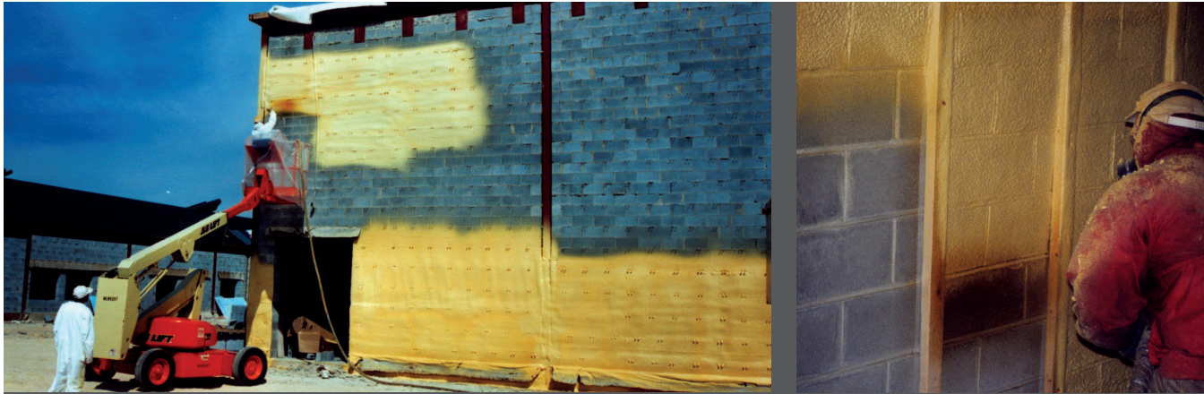
In the above curtain wall (CW) construction, 2-lb SPF is used to insulate the exterior of a building, helping to eliminate thermal bridging, while adding a secondary barrier against water penetration to the inside of the building. On the right, 2-lb SPF is used to achieve high R-value in a limited space.