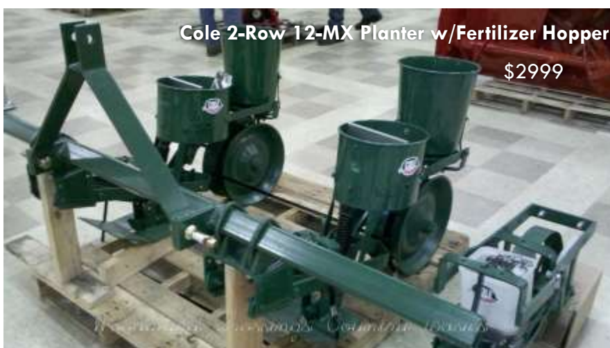
Cole 2-Row 12-MX Planter w/Fertilizer Hopper