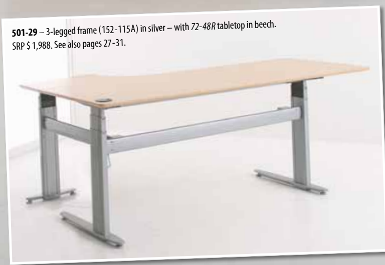
501-29 – 3-legged frame (152-115A) in silver – with 72-48R tabletop in beech. SRP $ 1,988. See also pages 27-31.