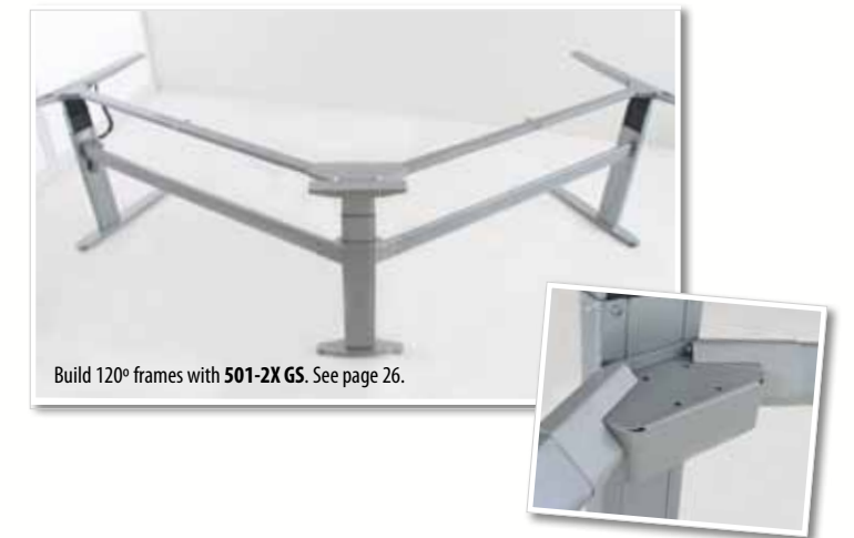
Build 120° frames with 501-2X GS. See page 26.

501-29 is perfect for taller individuals. At its fully extended height it measures 52". Extremely strong and stable it has a maximum load of 220 lbs*. With the newest 67 3 / 4 "-length the series consists of five standard widths and is also available as a 3-legged version. Integrated with automatic safety stop function. Removable top bracket allows for easy installation of keyboard support. See specifications on pages 28-31.