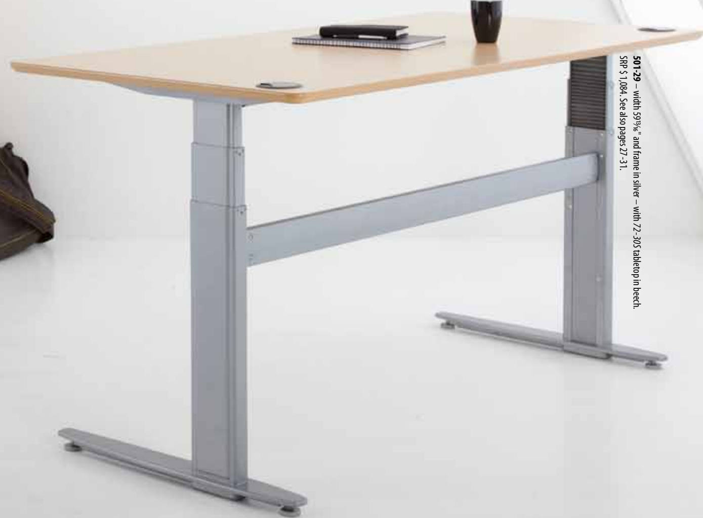
501-29 – width 59 3 / 16 " and frame in silver – with 72-305 tabletop in beech. SRP $ 1,084. See also pages 27-31.