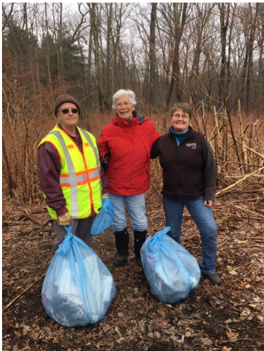
Intrepid CGLT members cleaning trash along Kettle Brook Path in Cherry Valley for Earth Day.