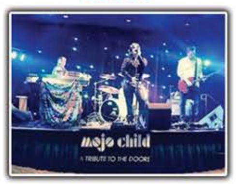
Mojo Child - A Tribute to the Doors