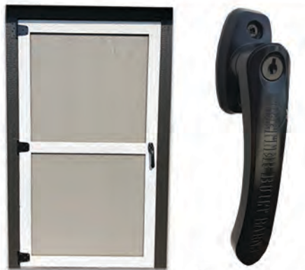
Standard 41" Door Heavy-Duty Door Handle

HOW MUCH CLEARANCE IS NEEDED? We need at least 24" around the building for construction. You will appreciate the extra room when painting the structure.