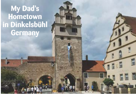
My Dad's Hometown in Dinkelsbühl Germany