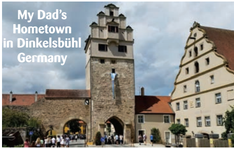
My Dad's Hometown in Dinkelsbühl Germany

We accept MasterCard, Visa, Discover and the Ohio Direction Snap Card