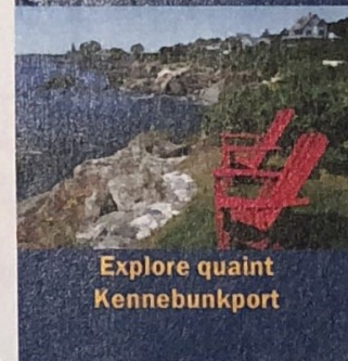
Explore quaint Kennebunkport