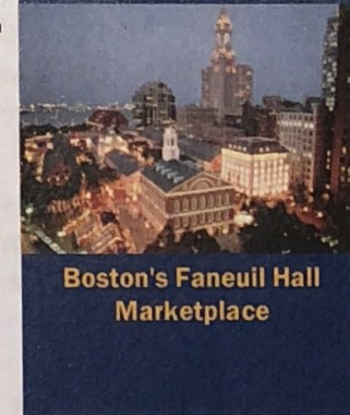
Boston's Faneuil Hall Marketplace