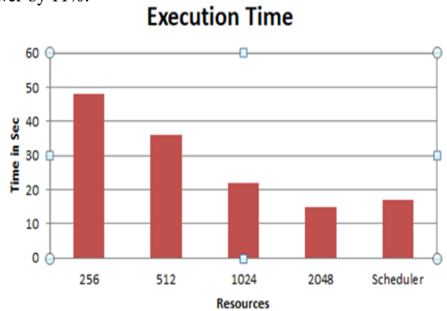
Figure 3: Comparison of execution time

A scientific workflow of 30 tasks was executed in serverless platform AWS Lambda by varying the configurations and execution time was evaluated. The prototype of the approach was implemented in same serverless platform for executing the scientific workflow of 30 tasks and execution time was evaluated for functions with 256 MB, 512 MB, 1024 MB and 2048 MB of memory allocated respectively. The comparative analysis shows that proposed approach made the execution time faster by 182%, 11% and 29 % respectively. The execution of function with 2048 MB was slower by 11%.