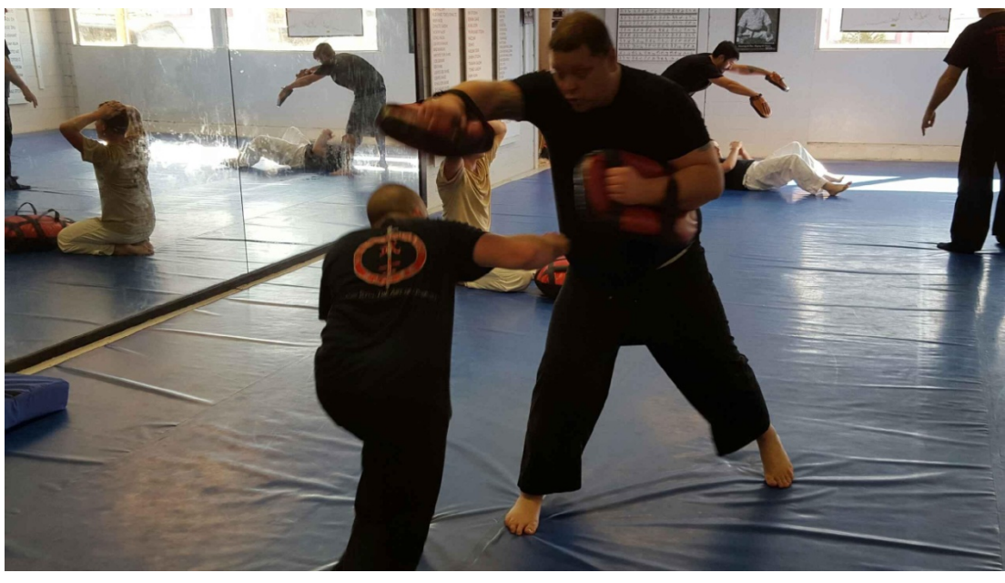
Some of the basic combat striking drills used in the Kodenkan Commando Striking Course