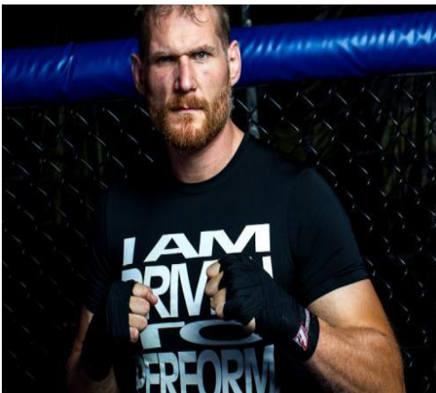
Former UFC Heavyweight Champion