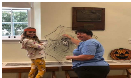
Adults and children's Halloween Party on Sunday, October 24, 2021