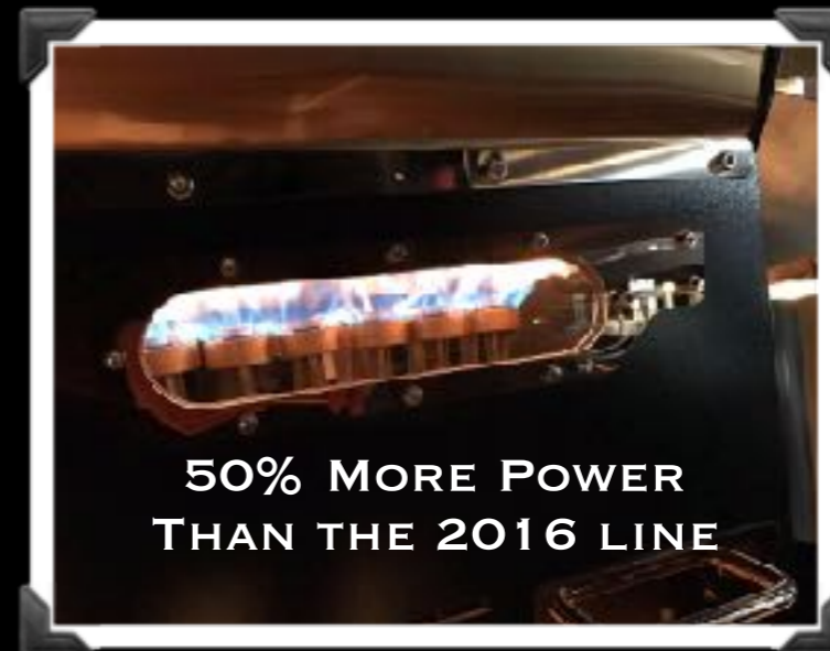
50% MORE POWER THAN THE 2016 LINE