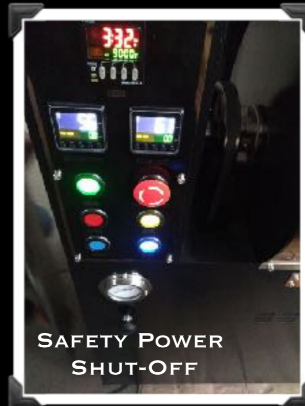
SAFETY POWER SHUT-OFF