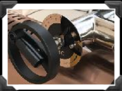
ALL NEW MDDS AIRFLOW

BUCKEYECOFFEE.COM 623.332.1360 INFO@BUCKEYECOFFEE.COM