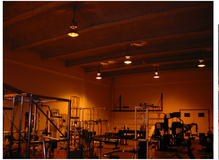
SOTA DRAMA STUDIO (before) 2002