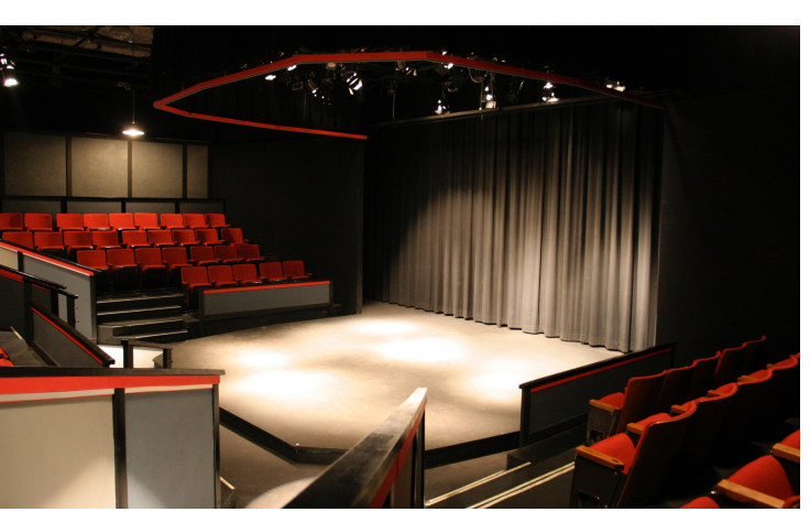
SOTA DRAMA STUDIO (after) 2010