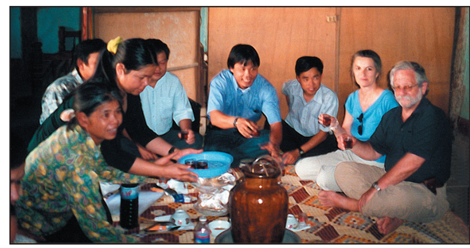
This patient was so delighted at our performing his surgery that we were invited to his village for dinner with the hospital staff and his family.