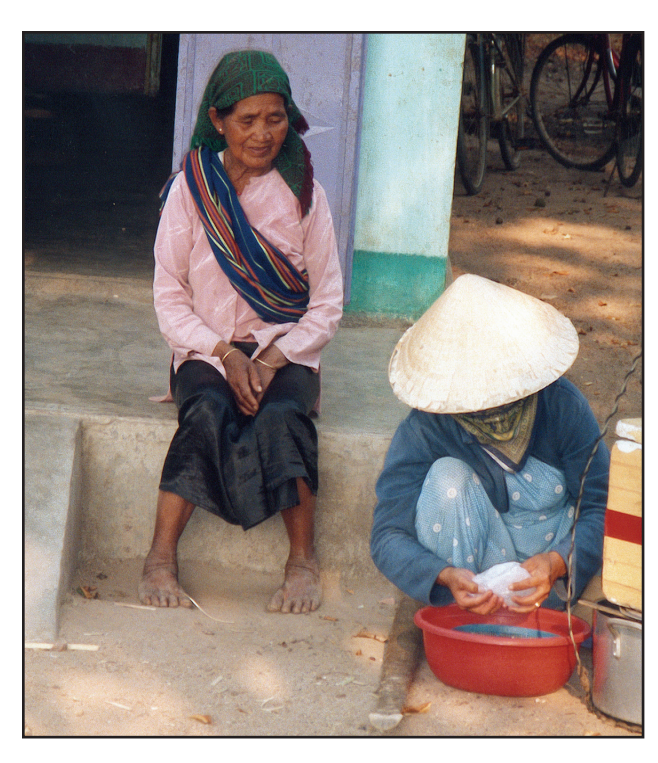
Jurai women in Kon Tum