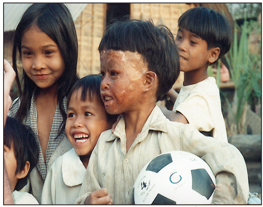
The child in this picture has severe burns over his entire face.

Since MILPHAP-19 was started in 1999, we've had excellent success. The Vietnamese government dedicates most of its financial resources for healthcare to the large populated areas and the areas where there is tourism and a large foreign presence. The areas that we specialize in are the rural areas in farreaching provinces of Vietnam, which need the most help and which are the least evolved medically, and where we can have the greatest impact. I know that with your help, we can make a difference.