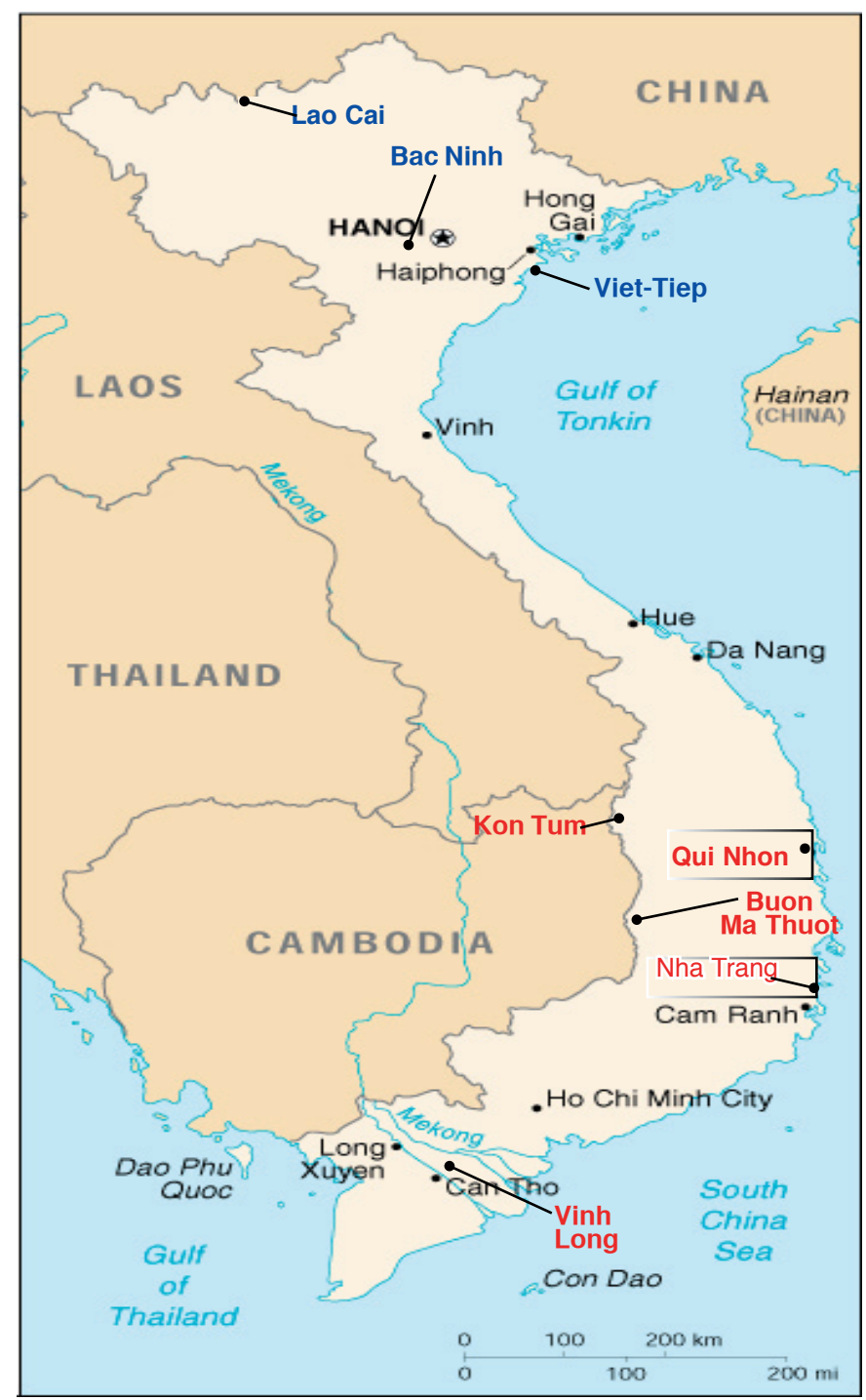
Vinh Long, Buon Ma Thuot, Nha Trang, Qui Nhon and Kon Tum are present MILPHAP-19 programs. Lao Cai, Viet-Tiep and Bac Ninh are planned projects for the March 2006 visit.