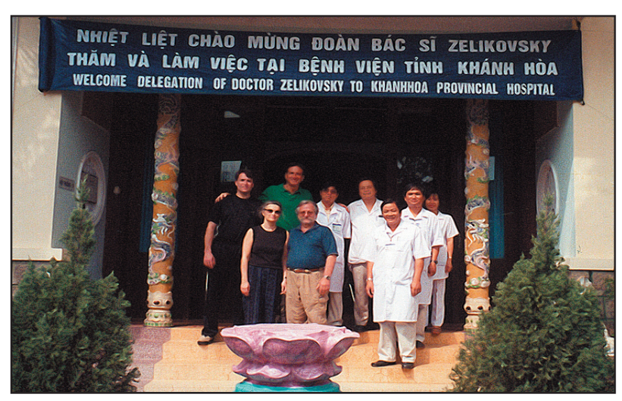
The MILPHAP-19 team being received by the medical staff of the province hospital in Nha Trang City.

Her family did not have the resources or the knowledge to arrange surgery for the child in Ho Chi Min City. I requested that the director of surgery of Nha Trang Province Hospital arrange surgery for the child in Ho Chi Min City and that MILPHAP-19 would pay for this, plus the transportation and living costs.