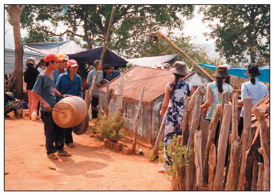
We also participated in a funeral service in a Jurai Village.

Kon Tum Province is situated near the junction of Cambodian and Laosian borders in the Central Highlands of Vietnam. The population consists of 2/3 aborigines and 1/3 Vietnamese. The aborigines represent two different ethnic minorities, the Behnar and the Jurai. We were very well received by the hospital physicians, staff and patient population. The hospital had no modern surgical equipment and the physicians had no advanced surgical capabilities. MILPHAP-19 donated a complete set-up for endoscopic urological surgery of the prostate and bladder tumors. Two surgeons at the hospital were designated to learn the endoscopic urological procedures. We performed a series of procedures with the Vietnamese surgeons under video monitoring. The Vietnamese surgeons were very enthusiastic and learned quickly.