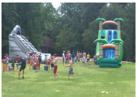
And play hard!