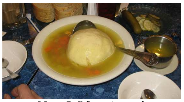
Matzo Ball Soup Anyone?