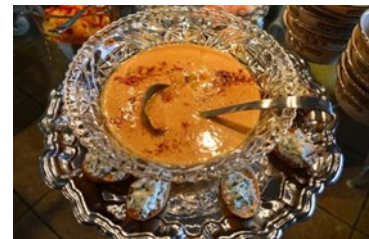
Betty Little made yellow gazpacho with herbed goat cheese toast.