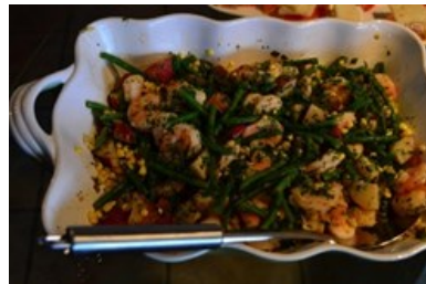
Jojo Keller's dish was a shrimp boil vegetable bowl.