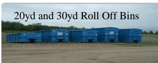
20yd and 30yd Roll Off Bins

**NEED ROLL OFF BIN SERVICE? Bin Services are ideal for: Renovations, Spring Clean-up, Roofing, Estate Clean-up, Yard Waste and almost anything else you can think of . . .