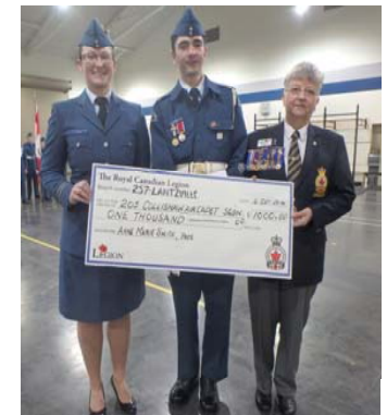
$1000 205 Collishaw Air Cadet Squadron