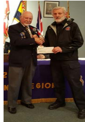
$500 Santzville Vol. Fire Dept.