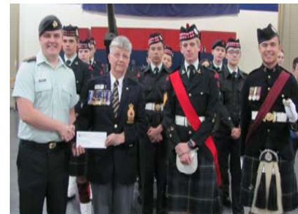
$1500 2422 Cdn. Scottish Army Cadets