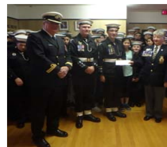
$1000 JFMCS Amphion Navy Cadets