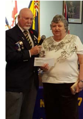
$300 Upper Island Music Festival Society