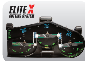
50" and 60" Elite X Deck – Cuts all grass types cleanly in any situation.