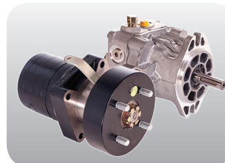
Pumps & Wheel Motors – Stronger transmissions for extended system life.