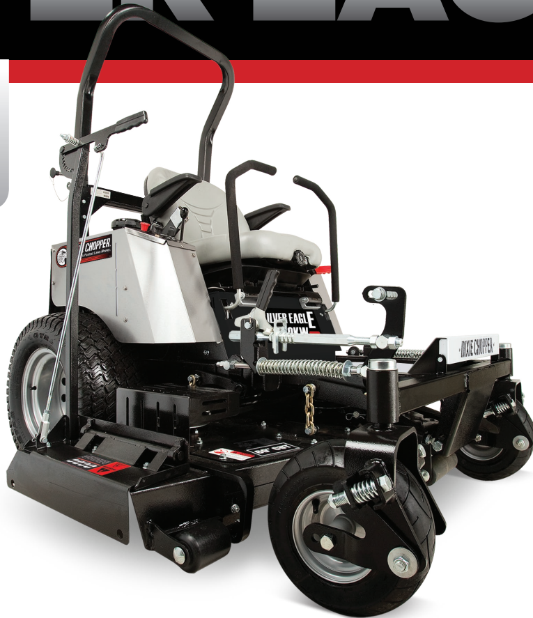
Silver Eagle 2760KW shown*