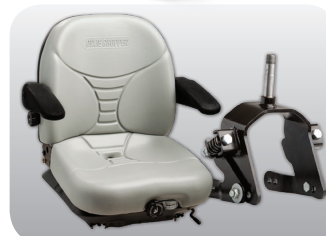
High Performance Package – Comes standard on KW and EFI models.