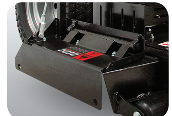
OCDC – Open and close the discharge chute on command.