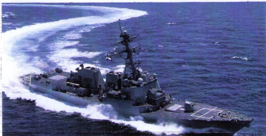
USS GRAVELLY (DDG 107)

A selection of events are for have lunch with the crew visit the White House ---