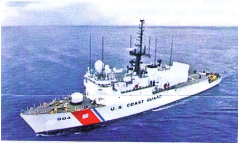
USCGC NORTHLAND (WMEC 904)