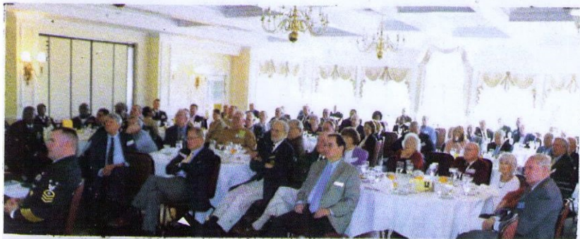
Luncheons scheduled each Spring, Mid-Summer and the annual Sea Services Luncheon in October.

red each month in Council's newsletter, "The Lucky Bag". Spend a day at sea --- - tour a Military base --- attend an air show --- enjoy a luncheon & guest speaker --- and a variety of other Council's activities!