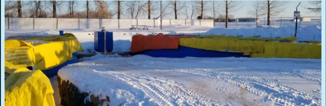
Picture shows the expansion walls have been installed.

There is progress being made at the Kamsack Swimming Pool because of the generous support from our community!