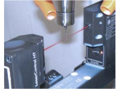
Support systems provide highest precision even with micro-tools