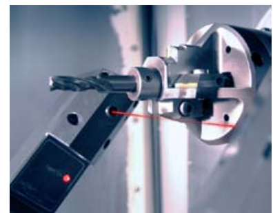
Fast detection of micro-wear at the cutting edge