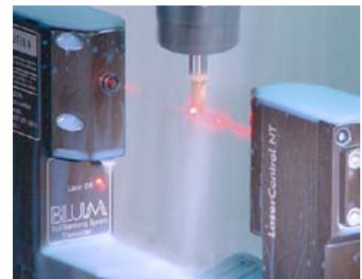
Absolutely reliable – patented NT-Electronics and intelligent Blum protection system