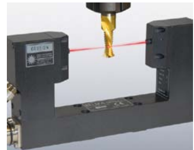
Non-contact monitoring of all kind of tool geometries