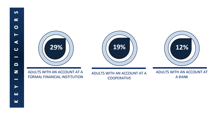
Figure 4: Account Ownership in Paraguay

Cooperatives play a key role in providing formal financial services to adults in Paraguay. Cooperatives have the broadest reach in providing basic saving and payment services within the formal financial system. Nineteen percent of adults in Paraguay report having an account at a cooperative, as compared to 12 percent for banks.