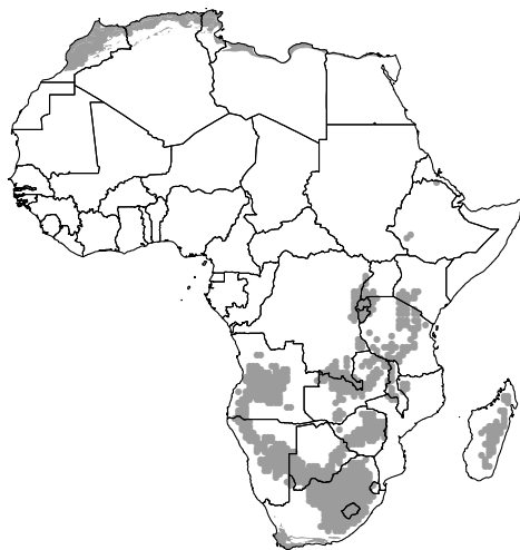
Figure B.1: African Territory Suitable for Large-Scale European Settlement

Three main considerations motivate why this is a reasonable instrument for studying the effects of colonial liberation regimes. First, all components of the instrument are exogenous in the sense that they are not caused by political factors that could affect regime durability. Importantly, the tsetse fly data comes from Alsan’s (2015) tsetse fly suitability index—which is derived from historical climate data—rather than from colonial or post-colonial maps of tsetse fly prevalence, which may be affected by climate change or by stronger states better able to control the fly (389). We also estimate models with various pre-independence covariates (logged population density in 1800, whether any ethnic groups in the country had a precolonial state, index of rugged terrain, colonizer fixed effects) to account for additional sources of heterogeneity. We use these rather than the more standard (relative to the literature) set of covariates used in Table 3, which are mostly post-independence and therefore inappropriate “post-treatment” controls relative to our instrument. Of course, factors such as historical population density might have also been influenced by the instrument, which is why we also estimate specifications without the covariates.