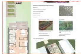
KC GREEN Central Plains (KC) Emerging Professional Finalist