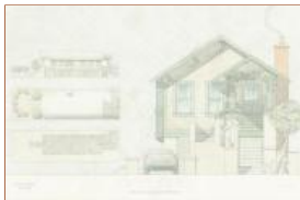
6713_The Eden Street House National Capitol Region Emerging Professional