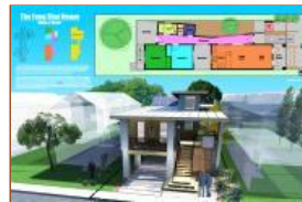
The Feng Shui House: Wind & Wa Northern California Student