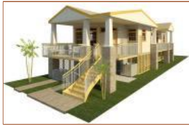
Entry 6996 (2010 USGBC Natural Chicago Student Finalist