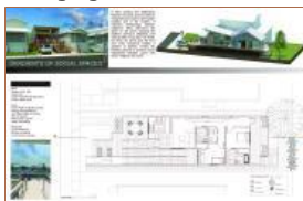
Gradients of Social Space Colorado Student Finalist