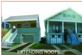
Extending Roots House Louisiana Emerging Professional Finalist