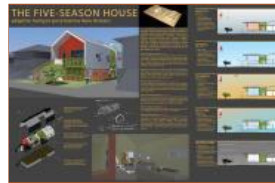
The Five-Season House Cascadia GBC Student Finalist