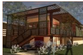
The Phoenix House: A 2010 USGBC Greater Houston Student