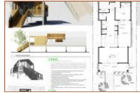
Duality in the Urban Context Florida Gulf Coast Student Finalist