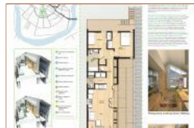
[adapt]Broadmoor Central Plains (KC) Student Finalist