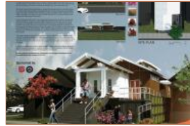
2010 USGBC Natural Talent Desi South Florida Emerging Professional Finalist