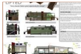
Design Empathy California Central Coast (C4) Student Finalist