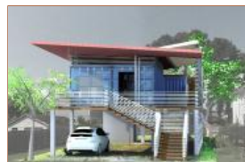
Entry 7455 (2010 USGBC Natural Inland Empire Student Finalist