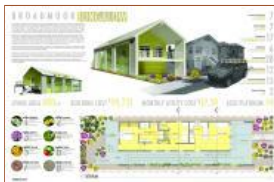
Broadmoor Bungalow California Central Coast (C4) Emerging Professional